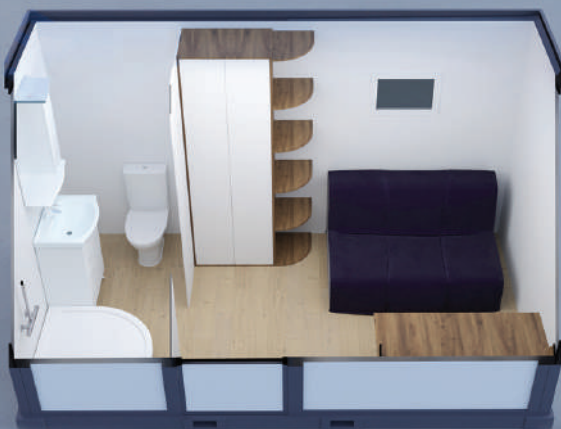
Internal Floor Plan

ECube Group is a company with Management Team drawn from more than 30 years' experience in the building industry. The Team has recognised the growing need to provide readymade quality accommodation facilities that meet the ever-changing demands of industry and transient population. Developed around the needs of FIFO activity in both Mining and Agricultural Industries ECube has solutions that are cost effective, readymade, and simple to install. Speak to our Sales Team about your accommodation building requirements TODAY.